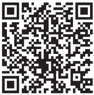
Sealing of Masonry